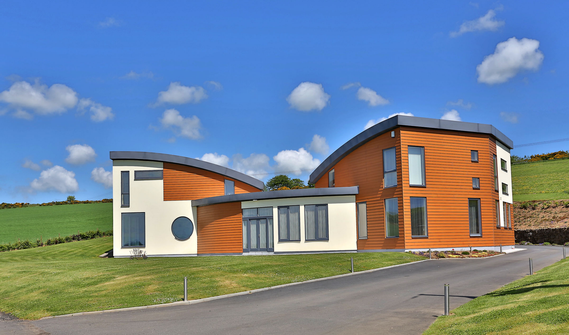
Endeavour Maud Aberdeenshire, AB42 5PD