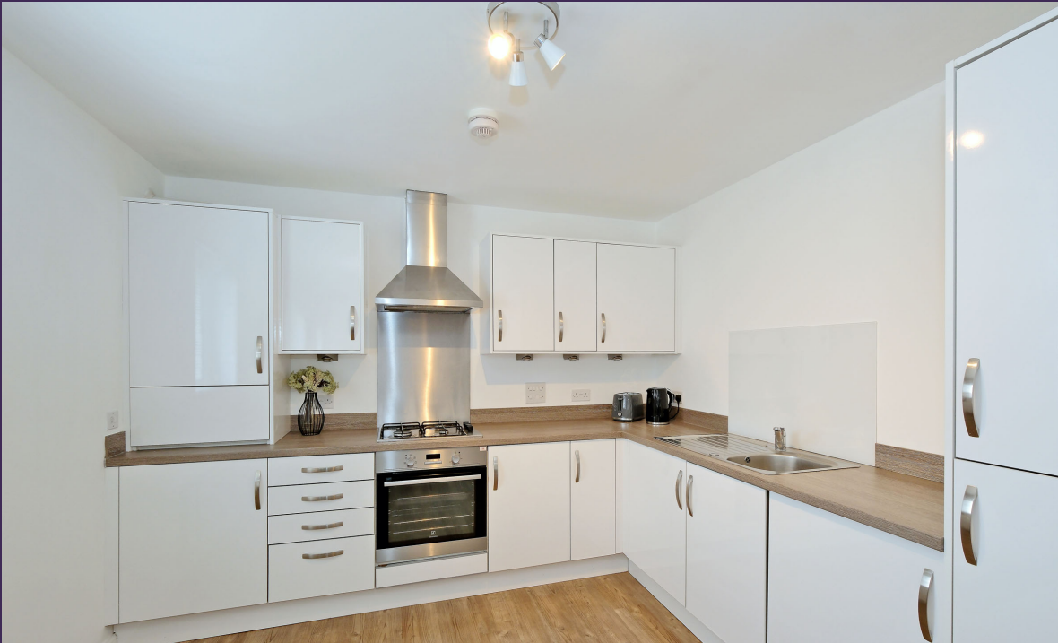
Kitchen / Diner / Lounge