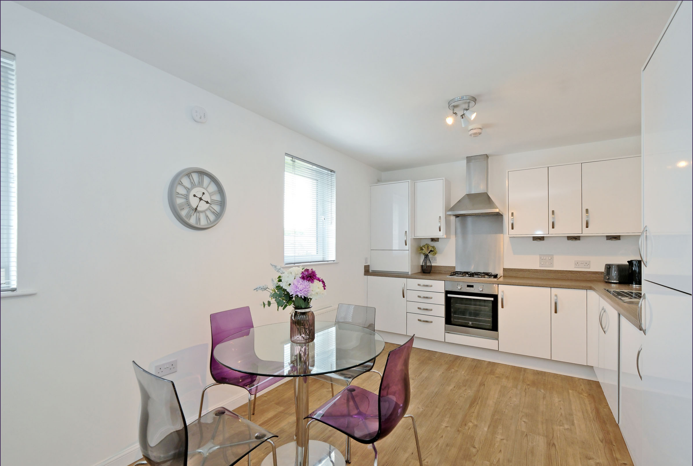
Kitchen / Diner / Lounge