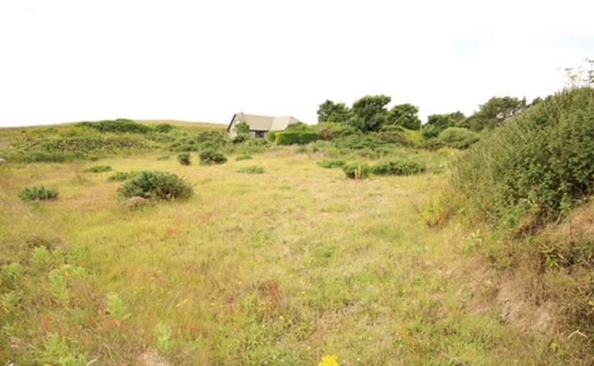
Alternative view of site