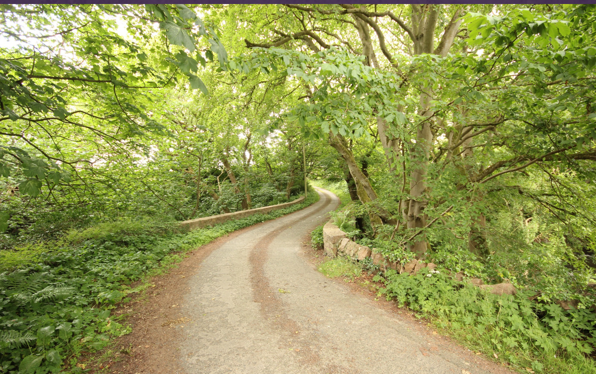
Track leading to site