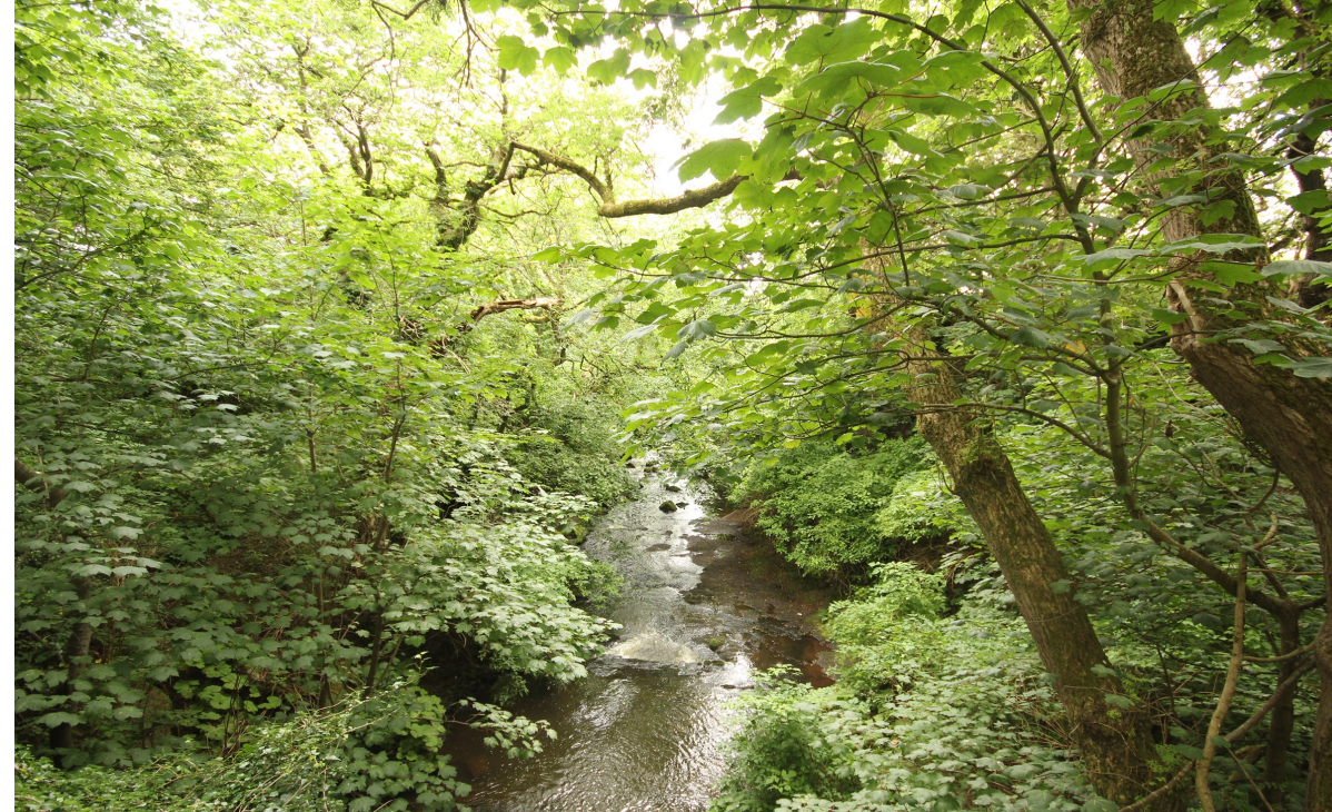
Water of Cruden

It is understood that mains water, electricity and telephone line are close to the site. Drainage would be to a septic tank. It would be the responsibility of any prospective purchaser to satisfy themselves regarding connection to the services and costs involved.