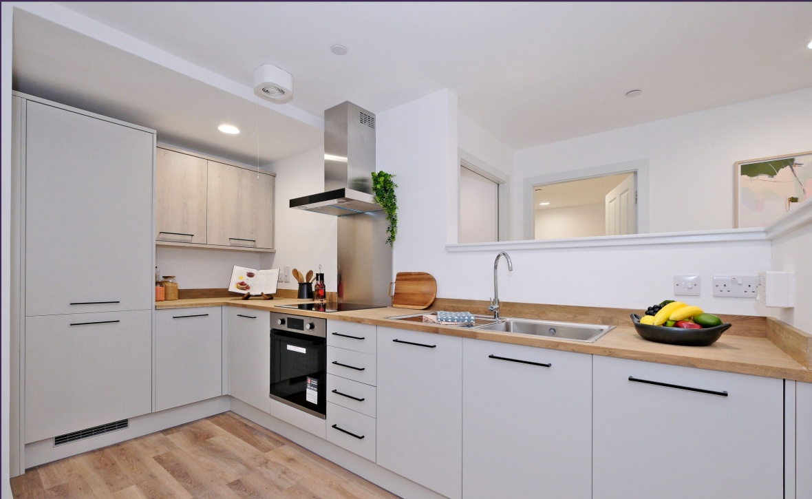
Lounge / Kitchen