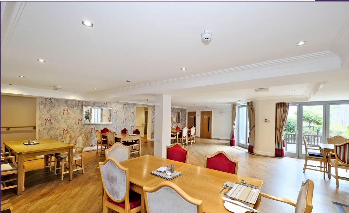
Common Dining Room