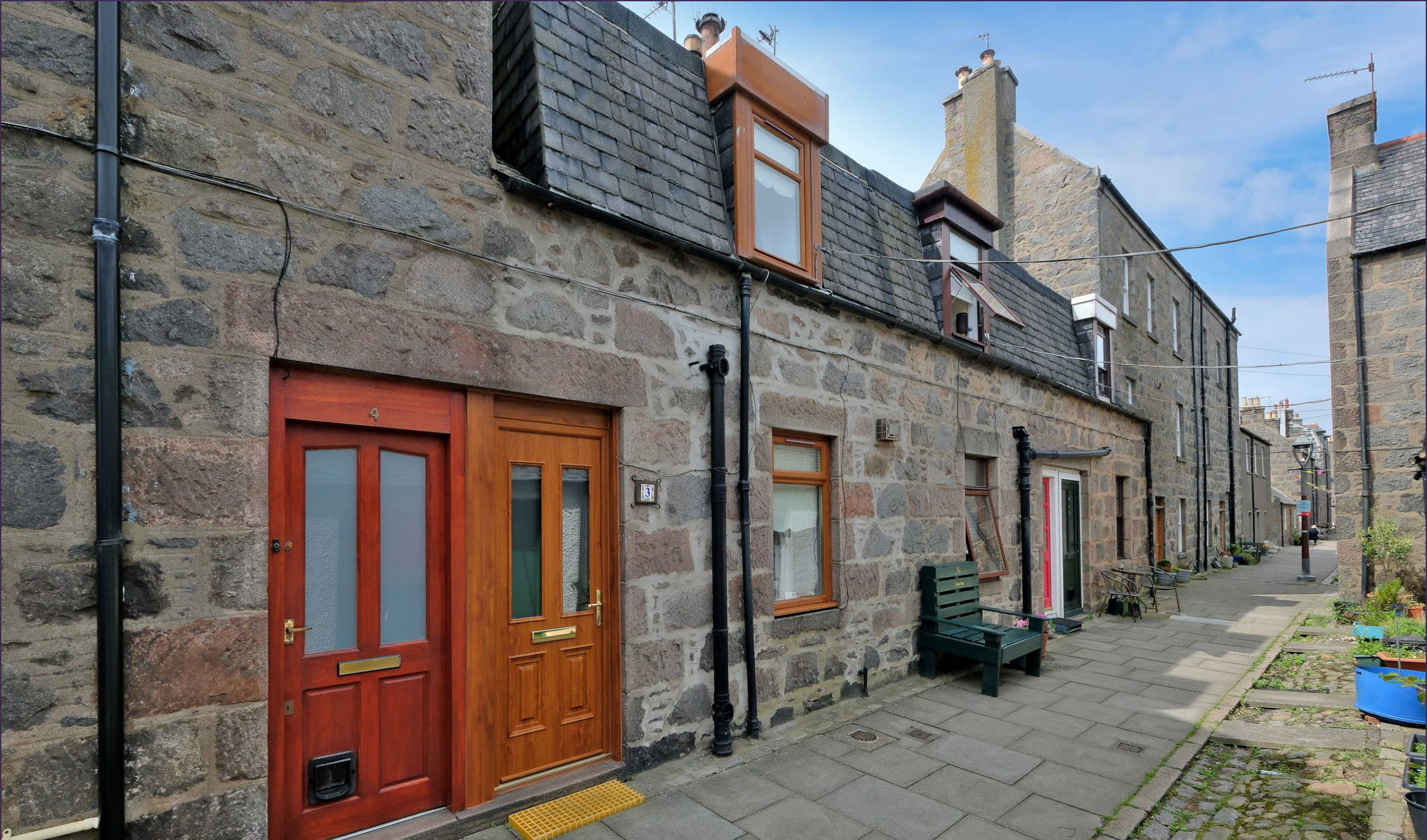
3 Pilot Square, Footdee, Aberdeen, AB11 5DS