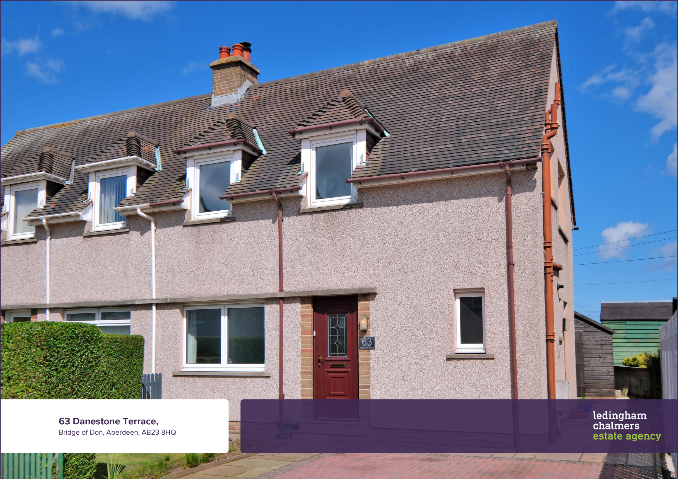
63 Danestone Terrace, Bridge of Don, Aberdeen, AB23 8HQ