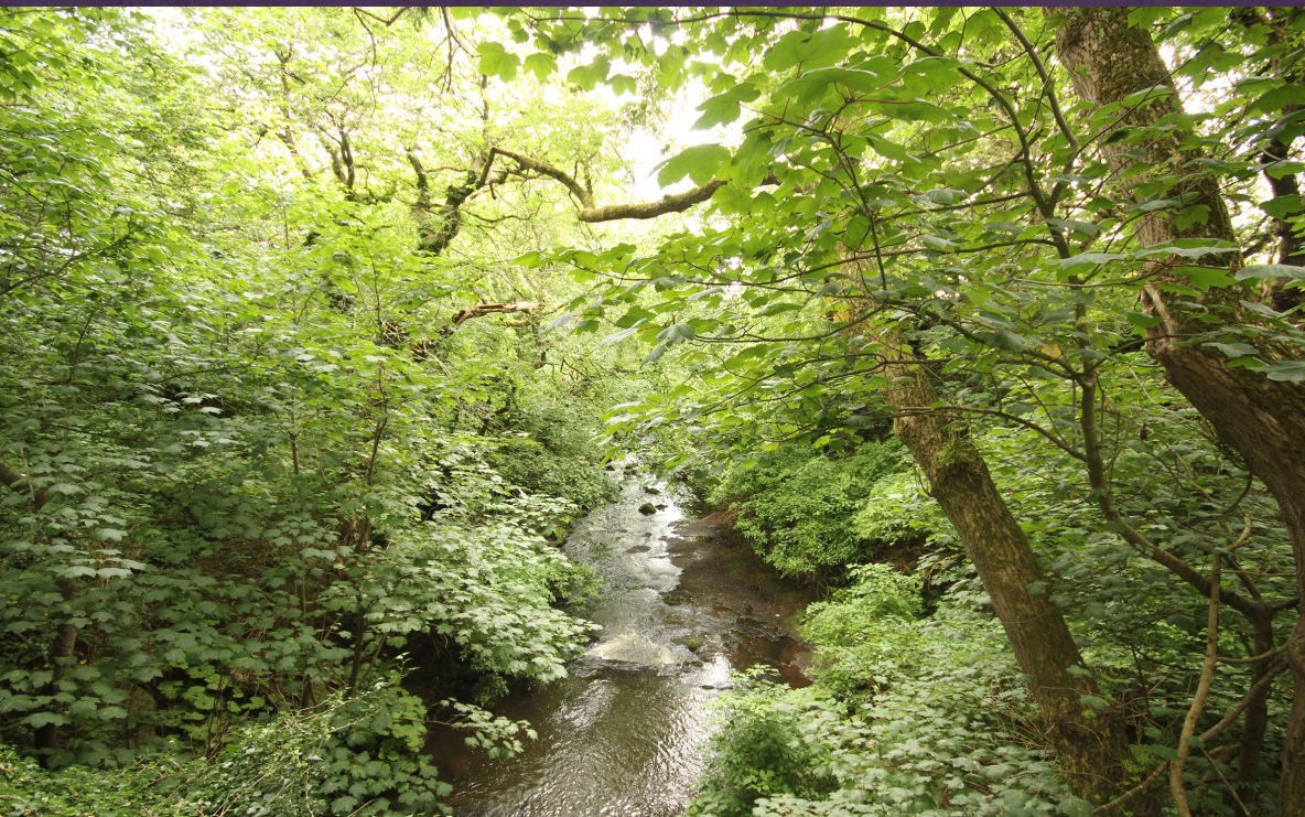
Water of Cruden