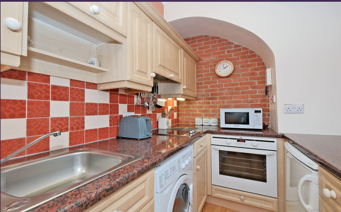
Lounge / Kitchen