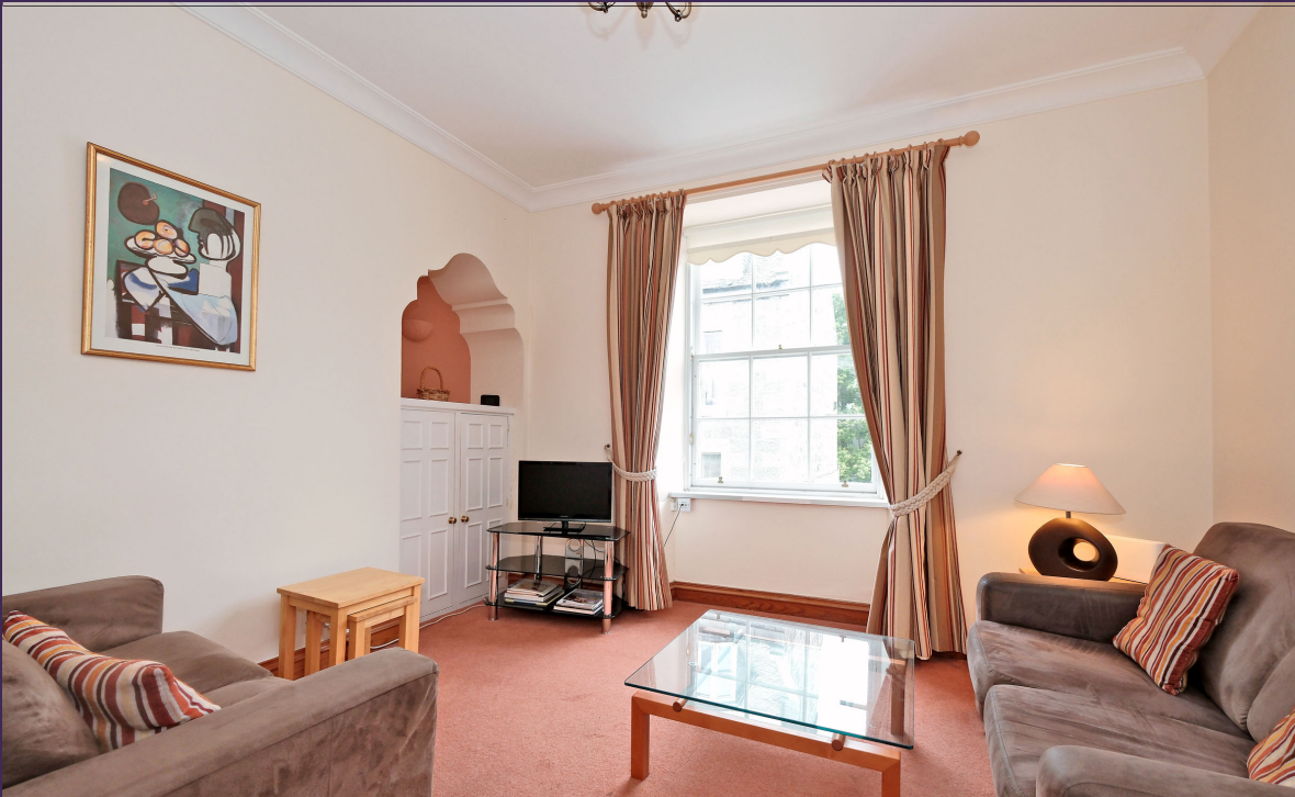
Lounge / Kitchen